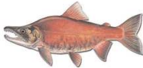
spawning Kokanee Salmon